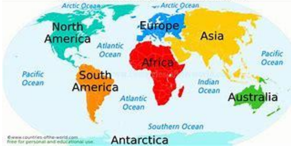
7 continents map with 5 oceans