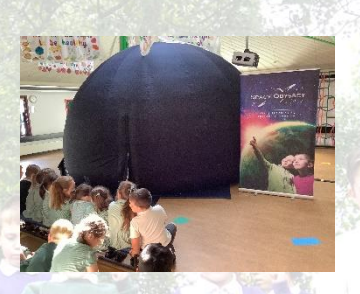
We loved learning about Space! We learnt facts about our solar system and had a visit from Space Odyssey.