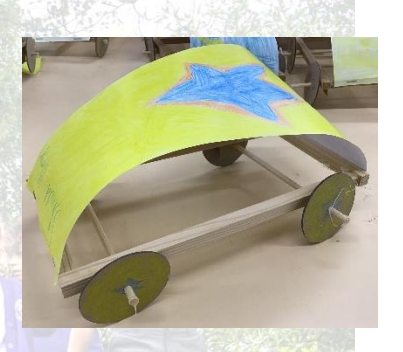
We developed our handiwork while making our superhero getaway vehicles, which we enjoying racing at the end of our topic!