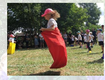
We had our first Sports Day! We had to run, jump, throw and complete an obstacle course.