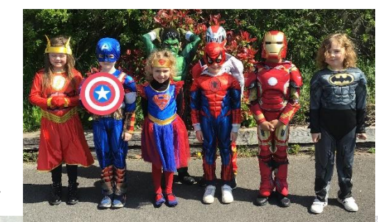
We thoroughly enjoyed our 'Superheroes to the Rescue' topic, starting it by coming into school dressed as our favourite superheroes!