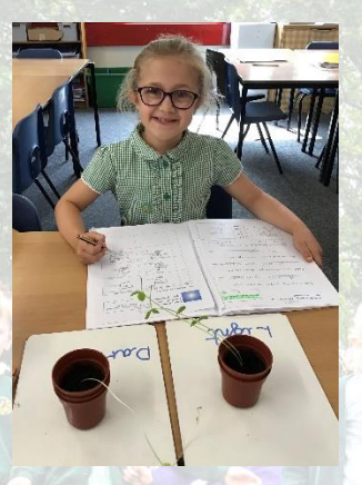
Our green fingers have completed two experiments to see if plants grow in a light or dark place, and in a warm or cold place.