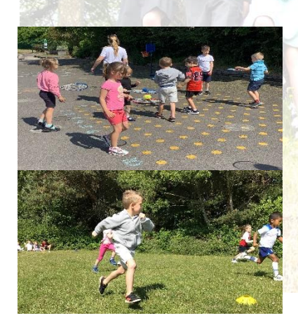
We played tennis games and had running races as part of our We Like To Move It Move It' sparkly starter.